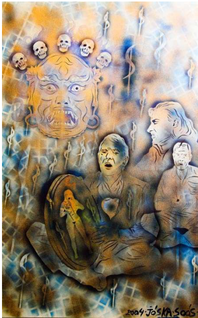
Great Shamanization, 2004

These are general characteristics we encounter in shamanism. The following is in Joska Soos' own words.