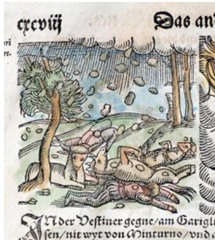
A Rain of Stones, from a manuscript in 1557.