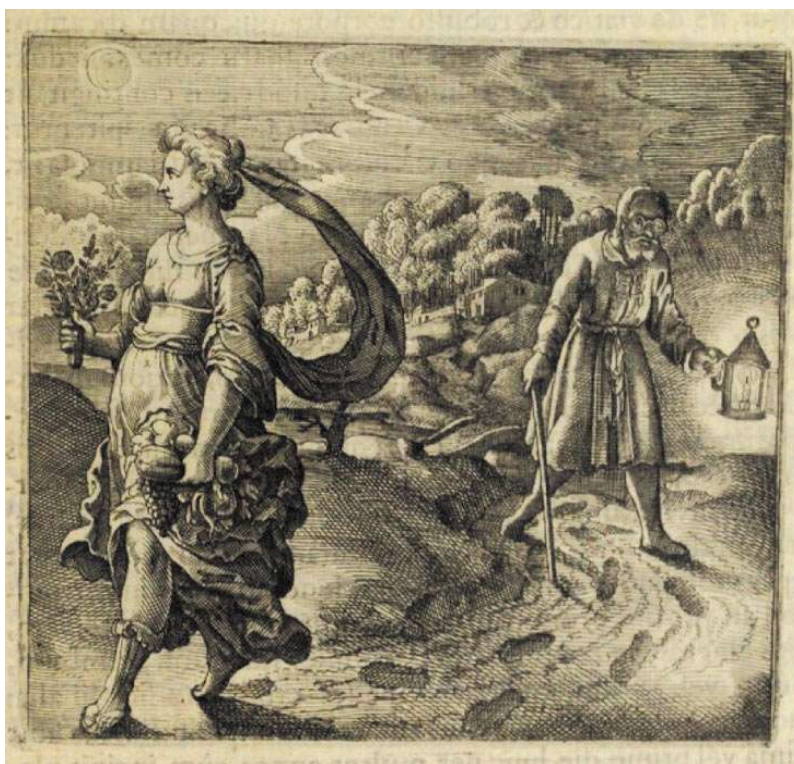
Following Nature, from Atalanta Fugiens by Michael Maier, 1618

The ancient observed the different phases of plant life throughout the year, and this also applies in the alchemical process. In alchemical emblems and text, the signs of the zodiac sometimes show up. Barbault stresses that the signs of the zodiac have nothing to do with the constellations of the same name. Sidereal astrology defines the signs relative to the apparent backwards movement of fixed stars. In tropical astrology, most commonly used, the signs have the same position as when this system was first established in Babylonian times some 2000 years ago, and were never adjusted as the signs were changing their position. Alchemists were using the tropical zodiac, which can only be seen as a division of the year into twelve section, and corresponding to the cycle of plant life. Barbault gives a detailed description of how the plant life forces withdraw, emerge and blossom during the year.