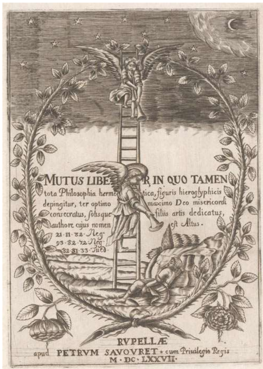
Mutus Liber , first plate

Barbault was primarily inspired by the alchemical work Mutus Liber , the Mute Book, published in La Rochelle, in 1677. It was reprinted numerous times since then. It consist mainly of illustrated plates. The name of its author is Altus, but this is a synonym. Some researchers claim that three people were involved in creating this manuscript. The original edition of 1677 can be found at e-rara . There is a PDF download button in the right column.