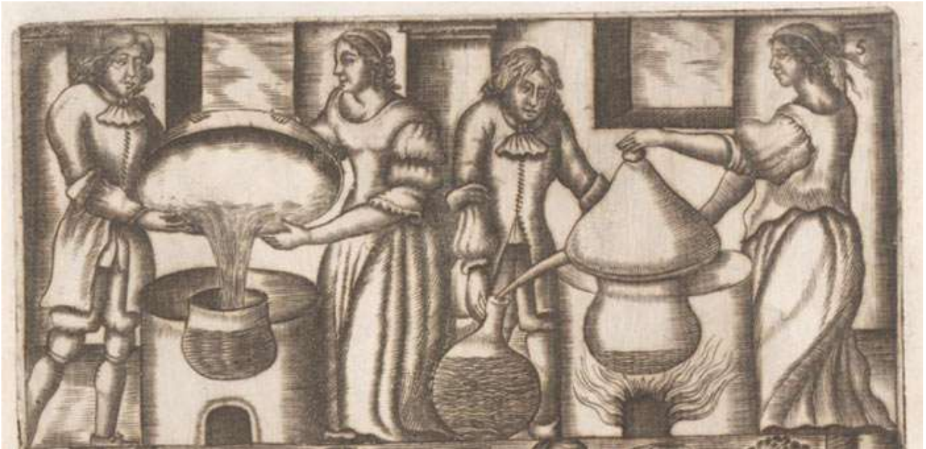
Detail from one of the plates of Mutus Liber