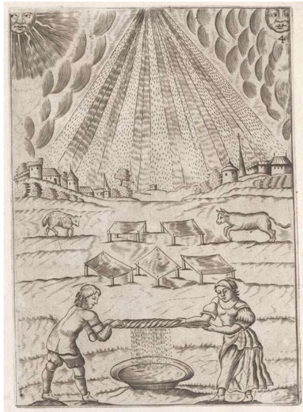
Mutus Liber, collecting dew. The ram and bull indicate that the dew should be collected during these astrological signs, Aries and Taurus, or April and May.

Gradually small plants, buds and a thousand other natural items are added to the Prima Materia . It is important to use very young plants, full of sap and dew. This mixture is left to steep slowly at a low temperature until a deposit is formed. The mixture is then gently heated in a specially prepared alembic, ensuring that the temperature never rises above 40°C. In this way, one can begin very slowly to feed the Matter, moistening, leaving to stand in the cold, then drying and so on, without breaks, for weeks, months or even years, depending on the goal in sight and the method adopted. Gradually, one chooses stronger and stronger plants.