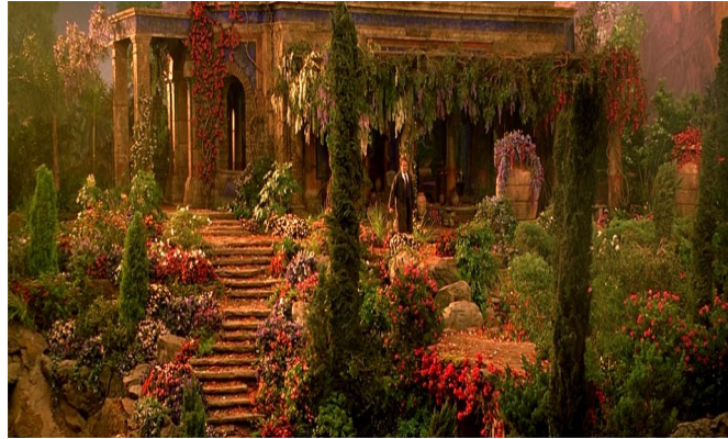
From the movie What Dreams May Come

Esoteric doctrines have been saying it for a long time: everything is energy. Modern day quantum physics tell the same thing. There is no solid matter, only 'energy packets' with densities and frequencies. When frequencies reach a certain threshold, matter loses its mass and enters the higher vibrational state in the astral realm. This astral realm is not some vaguely abstract concept. It is real, but quite different. The physical world has its three dimensions plus time, and is governed by physical laws. So, the astral world has its own dimensions and laws. Astral space and time is different. It is what physics now call the non-locality state of being. On the astral level one perceives distance but one can move from one point to another instantly. Time is not measured by the clock, but by the succession of events, or change.