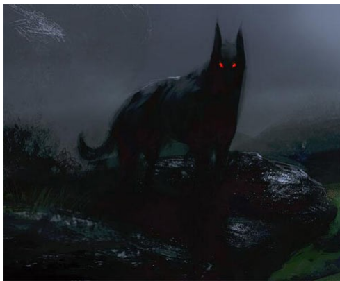
A large black dog as protector of a stone circle

In the lower regions of the collective unconscious, or the lower astral world, there are beings, intelligences, that are known to be disruptive in the lives of esoteric seekers. They often pretend to be benevolent and helpful, but they are deceptive and negative. This is an aspect that we clearly see with the so-called aliens in the lives of abductees, contactees and other people who are on a spiritual path. These beings can disguise themselves as highly evolved extraterrestrials, beautiful blonde beings, gods and goddesses, elves etc.