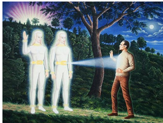
Tall blonde aliens, or tall blonde Fairies?

I do not exclude the possibility of real physical or dimensional beings from other places in the universe being present on this Earth. However, the UFO phenomenon does not reflect such presence. Also be aware that some countries' military have operational anti-gravity craft flying around.