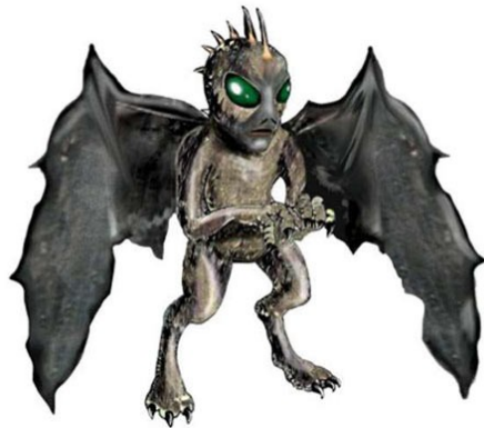
Volcan, Chiriqui, Panama, January 2008

How strange it might sound, some manifestations are of a human body with an animal head. Nothing new either, as we find representations of these beings in antiquity. Beings with horns are the deerman and the goatman. The Inuit people talk about shape-shifting "Caribou People" with strange, and yes often red glowing eyes. Deerwomen too! In Ponca City, Oklahoma there is legend of Deer Woman, deer legs but upper torso of a woman. It all depends on the belief system (which is also in the collective unconscious of that people) of a particular group of people. Goatmen are similar to the fauns of Greek mythology.