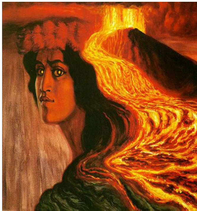
Pele, the Hawaiian Fire Goddess, is the goddess volcanoes and the creator of the Hawaiian Islands, painting by Herb Kane

"Volcanoes are centres in which the solar fire is concentrated and where salamanders gather in their various degrees; for wherever their element is active, there the fire-spirits are present. Far below the surface of the earth there burns an unquenchable fire, a veritable portion of the solar fire by which it is still fed, and with which it is in unbroken and direct connection. There dwell mighty members of the salamander's race; there labour many orders of nature-spirits and of angels, for the interior source of life and power to the planet exists at the centre of the earth. There its vital energies are renewed, jaded matter is re-charged and interstellar atoms are impressed with the special vibratory rate of the planet in order that they may pass into the circulating stream of the planet's atomic life. The fiery life-force of the Logos arises at the centre of the earth. No earthly channels are required for its passage; it arrives direct through the operation of the higher dimensional mechanism by which the system is ordered. Here are stored and renewed the magnetic energies of the planet, each under the charge of its appropriate nature spirit and angel; each type of force is a physical reflection of an aspect of the central divine energy and is intimately associated with the region of solar fire."