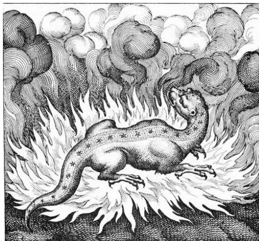
Emblem XXIX from Michael Maier's Atalanta fugiens, 1617