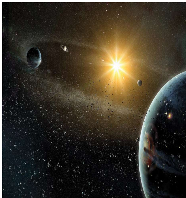
Fire fills all space in the solar system