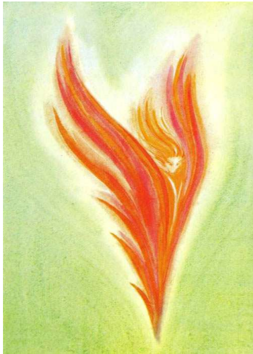
Salamander as seen by Geoffrey Hodson

Overall they do not have a fixed form as they consist primarily of streams of fiery energy. When viewed by humans, they display a distinct human face when not veiled by flames. Their eyes are then slanted upwards and strangely lit by fiery power. The head surrounded and outlined by flickering, orange-red little flames. Salamanders vary in height from two or three feet to the great colossi of fire-power who are the Fire Lords associated with the sun.