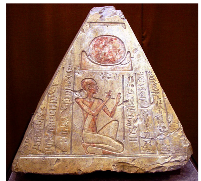
Pyramidion from the tomb of Rer, Abydos, Egypt, 7th century B.C. The sun disc sits between the signs for heaven and earth.