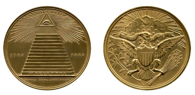
Great Seal Centennial Medal of 1882 The most accurate version of the Great Seal ever produced by the U.S. Government is this commemorative medal minted in 1882.

According to some sources, the eye in the triangle on top of the pyramid represents the secret grades of initiation above the known (the pyramidal structure of) 33 grades of masonry (Scottish Rite). Those secret grades are reserved for only a few select members. Together they form a group who control the entire world. With it comes secrets that are above the common 33 degrees. Is the symbol of the shining eye inside a triangle on top of a pyramid an old secret they once discovered?