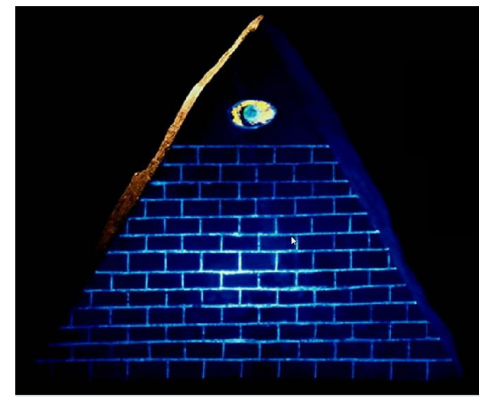
The stone under UV light.