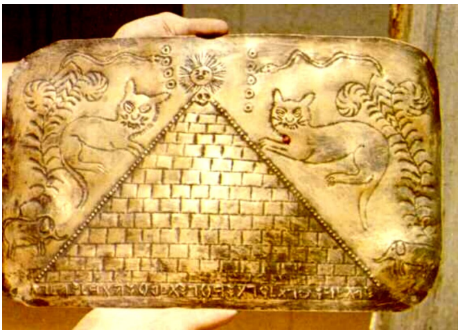
A golden plate depicting a sun atop of a pyramid with thirteen steps, with Paleo-Hebrew writing at the bottom. just like the one on the One Dollar bill!

Isn't it strange that the above artifact of the golden plate with a sun above a pyramid has thirteen steps just like the one on the One Dollar bill! One wonders if the Freemasonic rulers of the USA also had a similar ancient artifact in their (secret) collection!