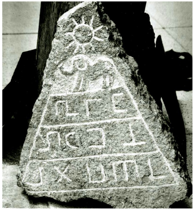
A stone triangular stone with inscribed pyramid and a sun at the top.