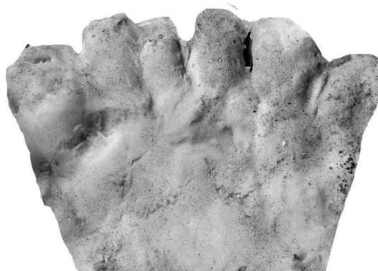
A mold of the six-toed footprint found in a plaster wall