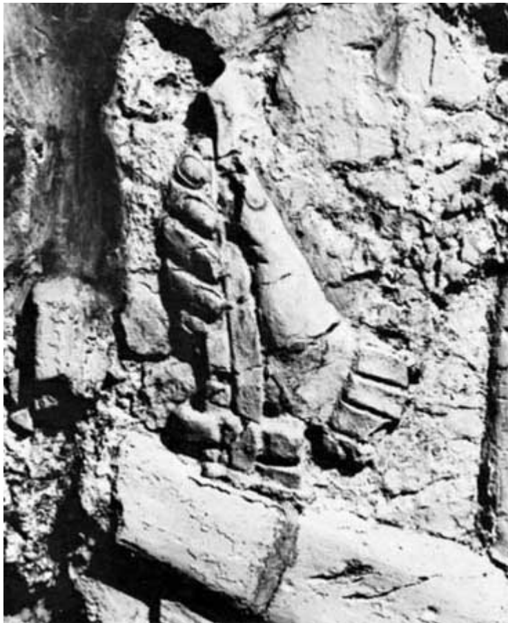
The ancient site of Palenque in Mexico, also displays bas-reliefs of six fingered and six toed people. More here .