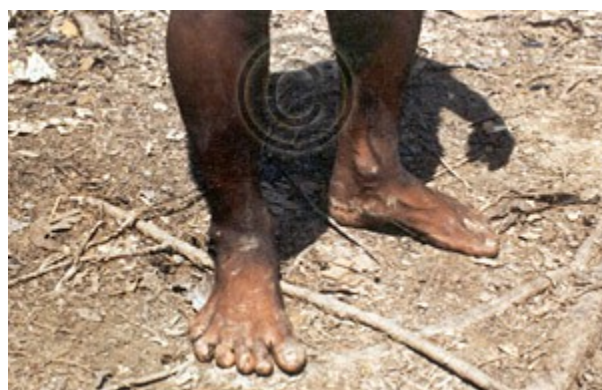
images from Waorani, the Saga of Ecuador's Secret People: A Historical Perspective

The six fingers and toes phenomenon with the Waorani is very interesting as it occasionally shows up with other people all over the globe. It is not just limited to that one tribe. Actually I stumbled on other "tribes", which have the six digit phenomenon running through their genetic lines. It is amazing, when you start researching that stuff, that what you thought is a singular case, turns out to be one of several.