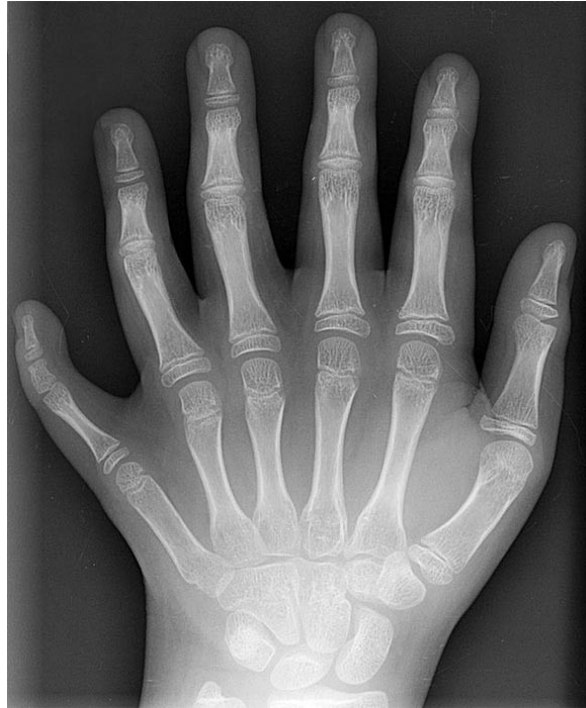
x-ray of a six digit hand with fully formed fingers

It is said that the giants who roamed the earth had six fingers. It is even mentioned in the Bible. It seems that this characteristic was passed on to humans. Although normally recessive (dormant), this DNA code can become dominant. There have been singular persons but also groups of people who were born with a fully functional sixth finger on each hand, and also with six toes, although occasionally the sixth finger is partial. The six digits appearance is a significant DNA mutation that is a perfectly healthy one. It is not a screwed up DNA code due to radiation or something like that. I think its importance lies in the fact that our DNA has dormant characteristics that can give a human different physical appearances. This is also the case with elongated skulls (next chapter), with which people were born. The question is: what has unlocked these other DNA codes in the past?