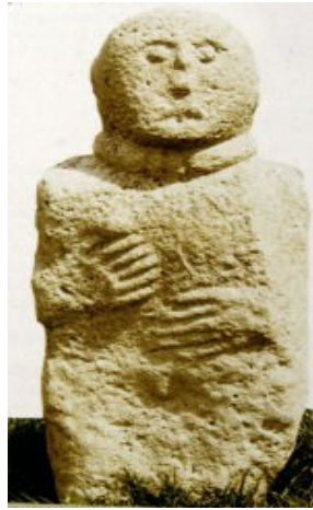
Image of a late Iron Age musician, with six fingers, from Pauvrelay, Indre-et-Loire, France